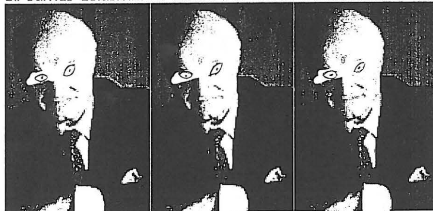
Sir James Goldsmith Sir James Goldsmith Sir James Goldsmith