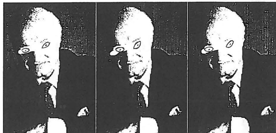
Sir James Goldsmith Sir James Goldsmith Sir James Goldsmith